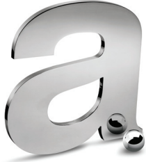
Edgeblend™ (Up to 24")