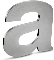
Satinbrite™ Face & Polished Sides