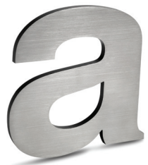
Satinbrite™ Face & Painted Sides