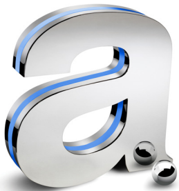
Stainless Steel Mirror Polish