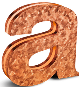
Random Orbital Copper