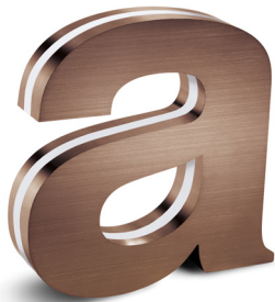
Medium Oxidized Satin Brushed