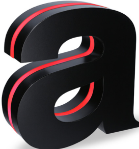
Painted Stainless Steel