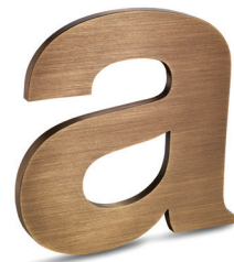
Medium Oxidized Satin Brushed