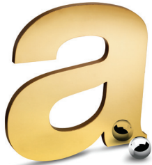
Mirror Polish (Up to 24")

Bronze alloy 220 provides a distinguished reddish gold appearance. Virtually all available finishes offer a warm architectural look in interior applications, while shades of oxidation perform well in both the interior and exterior. All bronze solid cut letters have a protective clear coat.