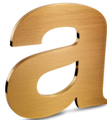
Satinbrite™ Face & Polished Sides