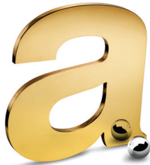
Edgeblend™ (Up to 24")