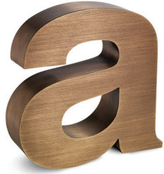
Medium Oxidized Satin Brushed