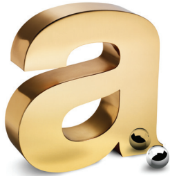
Mirror Polish (Up to 24")

Bronze alloy 220 provides a distinguished reddish gold appearance. Virtually all available finishes offer a warm architectural look in interior applications, while shades of oxidation perform well in both the interior and exterior. All bronze fabricated letters have a protective clear coat.