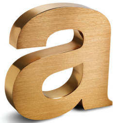
Satinbrite™ Face & Polished Sides