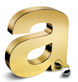
Mirror Polish (Up to 24")

Brass alloy 280 provides a distinguished gold appearance. Virtually all available finishes offer a warm architectural look in interior applications, while shades of oxidation perform well in both the interior and exterior. All brass fabricated letters have a protective clear coat.