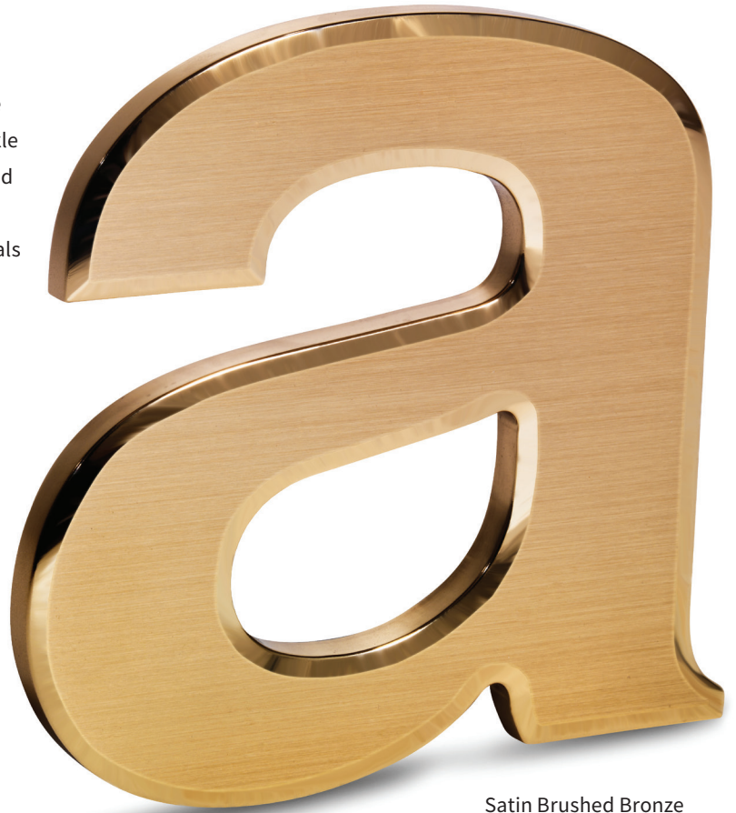
Satin Brushed Bronze with Mirror Polish Edge