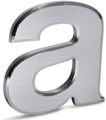
Satin Brushed Aluminum