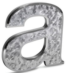
Random Orbital Aluminum