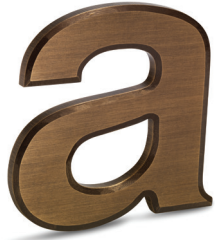
Medium Oxidized Brass