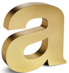
Bright Gold Satin