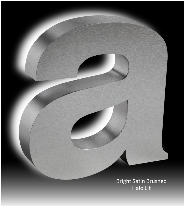
Bright Satin Brushed Halo Lit