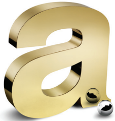
Bright Gold Polish (Up to 24")