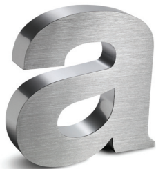
Satinbrite™ Face & Polished Sides