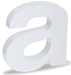
#101 - Painted Face & Back with Clear Sides* (*Up to .5" deep)

Several options are available for acrylic letters. The most popular is painted face and side with all PMS color matches available. Acrylic letters are cut with sharp square edges, corners and crisp details...never radiused. Premium quality cell cast acrylic is used and can be installed in both interior and exterior applications.