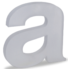
#106 - Non-glare Face & Sides