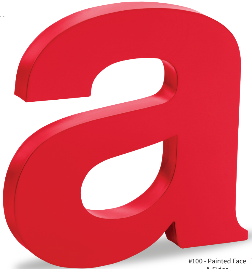
#100 - Painted Face & Sides