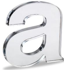
#107: Clear Face & Side